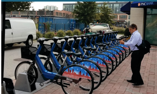
Baltimore Bikeshare, Baltimore, MD