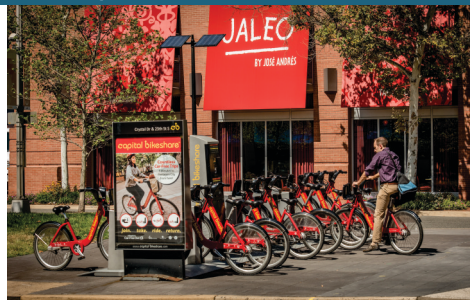
Capital Bikeshare, Washington D.C. region