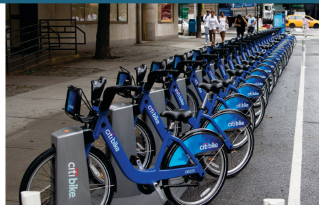
Citibike, New York City