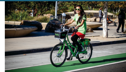
Breeze Bikeshare, Santa Monica, CA